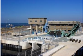
KAMANAVA Area Flood Control and Drainage System Improvement Project