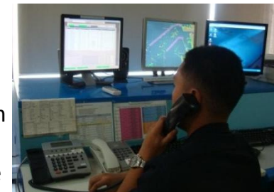
VSAT Satellite Communication System