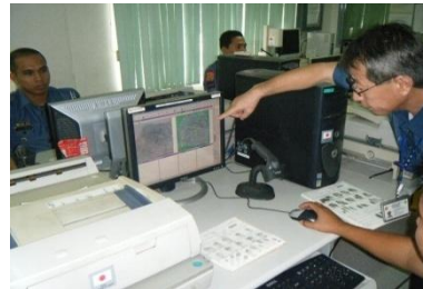
A Japanese expert is teaching a PNP officer how to collect fingerprints and use the AFIS.