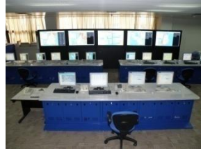
Improvement of Flood Forecasting and Warning System Project in the Pampanga and Agno River Basins