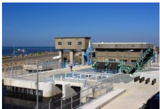
KAMANAVA Area Flood Control and Drainage System Improvement Project