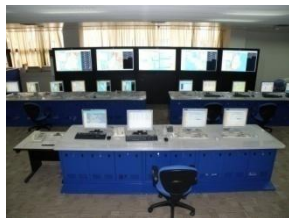
Improvement of Flood Forecasting and Warning System Project in the Pampanga and Agno River Basins