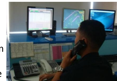
VSAT Satellite Communication System