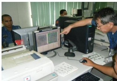
A Japanese expert is teaching a PNP officer how to collect fingerprints and use the AFIS.