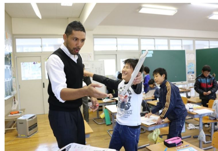
ALT assigned in Wakayama prefecture with his students

(re-appointments possible for a maximum of 5 years)