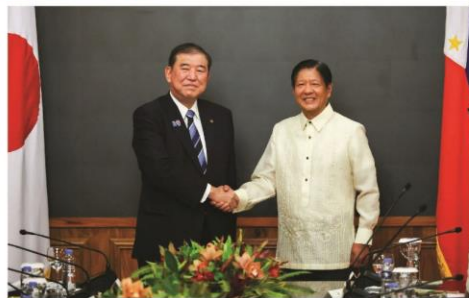
DEEPENING RELATIONS (From left) Japanese Prime Minister Ishiba Shigeru and Philippine President Ferdinand Marcos Jr. shake hands during the Japan-Philippines Summit Meeting.