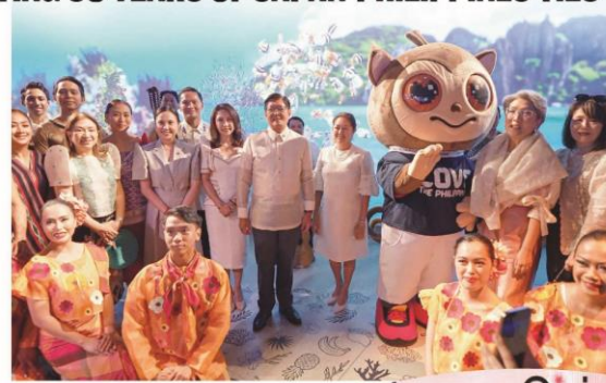
President Ferdinand R. Marcos Jr. & First Lady Louise Araneta-Marcos visit the Philippine Pavilion at the Expo 2025, Osaka, Kansai, Japan