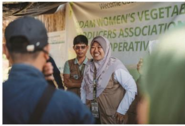
A JICA trainee from Mindanao sharing her agriculture knowledge to women farmers' association under JICA's CDPB