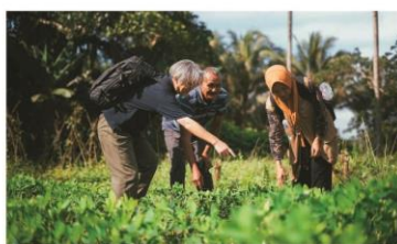
MUTUAL LEARNING A Japan International Cooperation Agency (JICA) expert is joined by an agricultural worker and farmer beneficiary from the Bangsamoro Autonomous Region in Muslim Mindanao, Philippines.