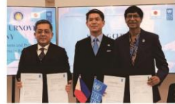
Turnover Ceremony for The Project for Raising Voters' Awareness and Promoting Digitalization of Electoral Process in Bangsamoro

As we move forward into the future, we will continue to weave this tapestry together. Thread by thread, we will