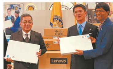
Turnover Ceremony for the Project for Raising Voters' Awareness and Promoting Digitalization of Electoral Process in Bangsamoro