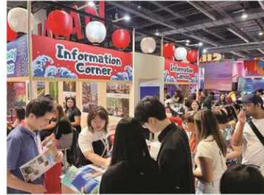
Japan pavilion at Travel Madness Expo 2025