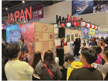
Japan pavilion at Travel Madness Expo 2025