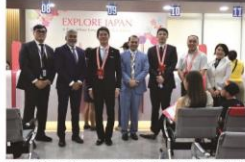
Opening of the Japan Visa Application Center in Parañaque City (JVAC)