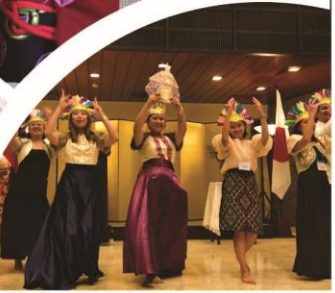
Send off ceremony for the 22nd batch of the Project for Human Resource Development Scholarship by Japanese Grant Aid (JDS) fellows from the Philippines