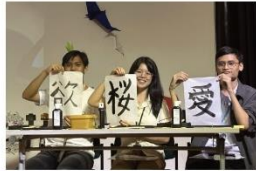
Hello! Japan provides educational courses on Japanese culture to schools and private organizations

Furthermore, my wife and I are delightedly grateful to have participated in many events celebrating our two countries' cultures here in the Philippines. Rooting for our Japanese volleyball teams together with Filipino fans, sharing the art of Nihon Buto or traditional dance on the occasion of Japan's National Day Celebration, interacting with young Filipino university students, appreciating beautiful Ikebana arrangements, and singing along to the Filipino-Japanese jazz band who performed at my humble residence are among my fondest memories with our Filipino friends thus far.