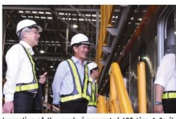
Inspection of the newly inaugurated LRT Line 1 Cavite Extension Phase I

Japan also continues to extend its steadfast support for the peace process in the Bangsamoro region, through the three pillars of the Japan-Bangsamoro Initiatives for Reconstruction and Development (J-BIRD). These efforts encompass capacity-building for the Bangsamoro Transition Authority (BTA), assistance in the transformation of former combatant communities into progressive and resilient societies, and the provision of socio-economic development assistance. As we look forward to the first Bangsamoro Parliament elections, we recognize this milestone as a significant stride towards achieving lasting peace and prosperity in the region.