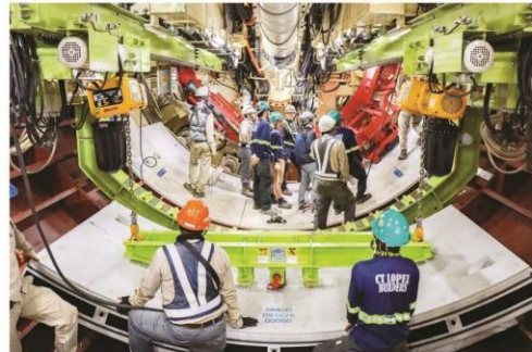
Ongoing Construction of the Camp Aguinaldo Station of the Metro Manila Subway Project (MMSPP)