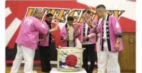
RECEPTION for the 70th Anniversary of the Japan Self-Defense Forces (JSDF) onboard the Japan Maritime Self-Defense Force (JMSDF) vessel JS SE.