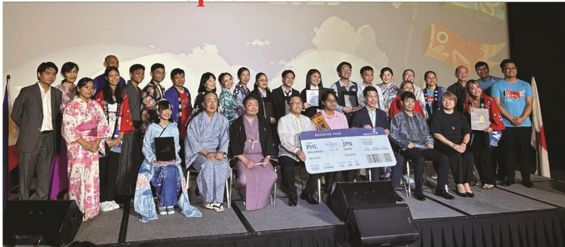
CELEBRATION OF CULTURE Nihongo Fiesta 2025 held at the Red Carpet Cinema, Shangri-La Plaza, Mandaluyong City.