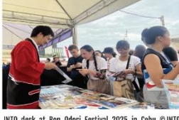
JNTO desk at Bon Odori Festival 2025 in Cebu