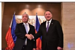
Defense Minister NAKATANI Gen and Secretary Gilberto Teodoro Jr. at the Japan-Philippines Defense Ministerial Meeting