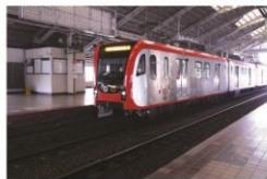
Restoring Livelihoods and Enhancing Resilience of Bohol Farmers and Fisherfolk Affected by Typhoon Odette