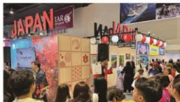
Japan pavilion at Travel Madness Expo 2025 «JNTO PHILIPPINES