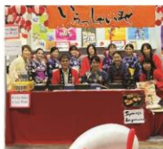
Embassy of Japan in the Philippines joins the 2024 International Bazaar at the World Trade Center in Pasay City