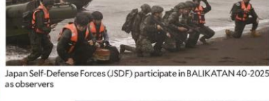
Japan Self-Defense Forces (JSDF) participate in BALIKATAN 40-2025 as observers