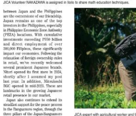
JICA expert with agricultural worker and farmer beneficiary from BARMM.