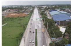
Inspection of the newly inaugurated LRT Line 1 Cavite Extension Phase I