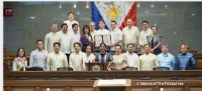
Signing Ceremony of the Regional Access Agreement (RAA)

The security cooperation thread is growing evidence of our deepening trust, driven by our shared commitment to a free and open Indo-Pacific (FOP). This concept, promoting peace, stability, and prosperity across the region through rules-based international order has certainly been realized by our bilateral cooperation. The Japan-Philippines Regional Access Agreement (RAA) signed in July 2014, for instance, has emerged as a landmark achievement for our two countries. Its unanimous approval by the Philippine Senate in December of the same year and its approval by the Japanese Diet last June underscores our shared commitment to regional peace and stability. In the recently held Japan-Philippines Summit Meeting, our two leaders further agreed to commence negotiations on an Acquisition and Cross-Servicing Agreement (ACSA). The meeting also confirmed the importance of an early conclusion of an Agreement on the Security of Information.