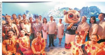
President Ferdinand R. Marcos, Jr. and First Lady Louise Araneta-Marcos visit the Philippine Pavilion at the Expo 2025, Osaka, Kansai, Japan.