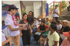
Signing Ceremony for "The Project for Promoting Human Security through the Community Economic Development and Livelihood Initiatives in Bangsamoro Region" (CEDAR)