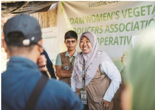
A JICA trainee from Mindanao sharing her agriculture knowledge to women farmers' association under JICA's CDPB

welcomed several prominent Japanese brands. Nitro opened its first store in 2024, shortly after I assumed my post last year. In addition, Mitsu-koshi BGC opened in mid-2023. These are landmarks in the growing Japanese retail presence in our market.