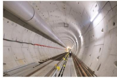
Tunneling works for the Metro Manila Subway Project constructed through JICA loan