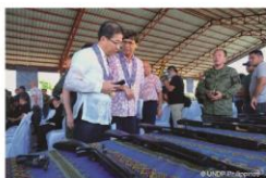
Signing Ceremony for "The Project for Promoting Human Security through the Community Economic Development and Livelihood Initiatives in Bangsamoro Region" (CEDAR)