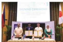
Signing Ceremony for "The Project for Promoting Human Security through the Community Economic Development and Livelihood Initiatives in Bangsamoro Region" (CEDAR)