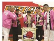
Reception for the 71st Anniversary of the Japan Self-Defense Forces (JSDF) onboard the Japan Maritime Self-Defense Force (JMSDF) vessel JS ISE