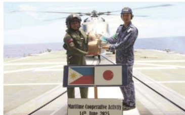
Japan Maritime Self-Defense Force (JMSDF) and the Philippine Navy (PN) conduct Bilateral Maritime Cooperative Activity (MCA) in the South China Sea