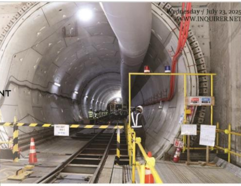
Ongoing Construction of the Camp Aguinaldo Station of the Metro Manila Subway Project (MMSP)