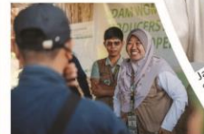
A JICA trainee from Mindanao sharing her agriculture knowledge to women farmers' association under JICA's CDPB