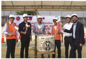
Officials from DOTr, JICA, EOJ, and project contractors celebrate the groundbreaking of the Bulk Supply Substation for the Subway Project