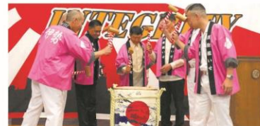
Reception for the 71st Anniversary of the Japan Self-Defense Forces (JDSF) onboard the Japan Maritime Self-Defense Force (JMSDF) vessel JS ISE