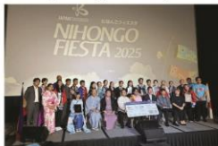
Nihongo Fiesta 2025 at the Red Carpet Cinema, Shangri-La Plaza, Mandaluyong City