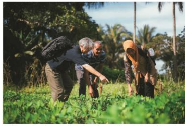
JICA expert with agricultural worker and farmer beneficiary from BARMM