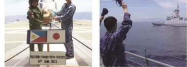
Japan Maritime Self-Defense Force (JMSDF) and the Philippine Navy (PN) conduct Bilateral Maritime Cooperative Activity (MCA) in the South China Sea