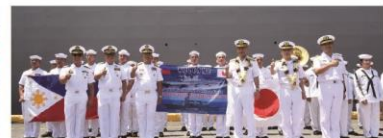
Japan Maritime Self-Defense Force (JMSDF) vessels JS ISE & JS SUZUNAMI conduct a port call at Pier 15, Port of Manila.