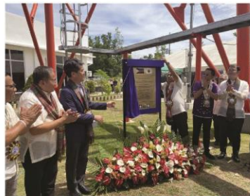
IMPROVING CLIMATE RESILIENCE Officials inaugurate the Cagayan de Oro River Basin Flood Forecasting and Warning Center in Misamis Oriental.

Japan has been further conducting a feasibility study for the OSA