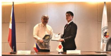
Signing and Exchange of Notes for the 2nd Official Security Assistance (OSA) Project