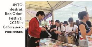
JNTO desk at Bon Odori Festival 2025 in Cebu «JNTO PHILIPPINES