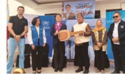
Handover ceremony for "The Project for Promoting Digital Birth Registration of Populations at Risk of Statelessness in Bangsamoro Autonomous Region in Muslim Mindanao (BARMM)" in Bongao, Tawi-Tawi