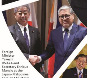
Foreign Minister Takeshi IWAYA and Secretary Enrique Manalo at the Japan-Philippines Foreign Ministers' Meeting