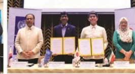
Signing Ceremony for "The Project for Promoting Human Security through the Community Economic Development and Livelihood Initiatives in Bangsamoro Region" (CEDAR)

create and enrich the fabric of friendship between our two nations. Let us work hand in hand, weaving a vibrant, rich, and beautiful future for Japan and the Philippines.