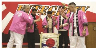
Reception for the 71st Anniversary of the Japan Self-Defense Forces (JMSDF) onboard the Japan Maritime Self-Defense Force (JMSDF) vessel JS ISE