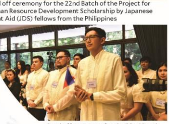
Send off ceremony for the 22nd batch of the Project for Human Resource Development Scholarship by Japanese Grant Aid (JDS) fellows from the Philippines