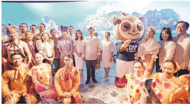
President Ferdinand R. Marcos Jr. &amp; First Lady Louise Araneta-Marcos visit the Philippine Pavilion at the Expo 2025, Osaka, Kansai, Japan