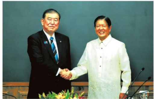
Japan-Philippines Summit Meeting: (L) Japanese Prime Minister Ishiba Shigeru and (R) Philippine President Ferdinand R. Marcos, Jr.

As our cooperation grows from strength to strength, robust people-to-people and cultural ties continue to play a role in the foundational thread of our trust. In my various visits across the Philippines’ vast regions, I’ve been truly overwhelmed by the local support for our bilateral partnership. It has been particularly heartwarming to witness our Filipino friends’ deep interest in and shared love for Japanese culture, clearly demonstrated by the record-high of over 820,000 Filipino visitors to Japan last year. With the recent opening of the Japan Visa Application Center (JVAC), we are optimistic about sustaining this encouraging trend in the years ahead.