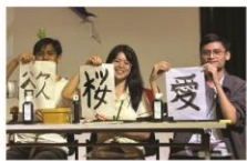
Hello!Japan provides educational courses on Japanese culture to schools and private organizations