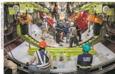
Ongoing construction of the Camp Aguinaldo Station of the Metro Manila Subway Project (MMSF)