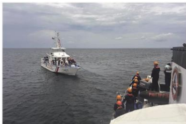
Japan Coast Guard (JCG) provides capacity building support to the Philippine Coast Guard (PCG)