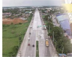
Completed expanded 22.46km Paridel Bypass Road in the province of Bulacan