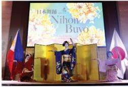
Japanese traditional dance performance or "Nihon Buto" at Japan's National Day Celebration