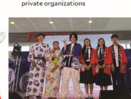
Special Hello!Japan session in Bicol with Japanese artist FuMi