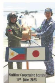
Japan Maritime Self-Defense Force (JMSDF) and the Philippine Navy (PN) conduct Bilateral Maritime Cooperative Activity (MCA) in the South China Sea.