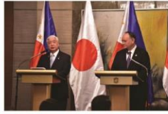
Defense Minister NAKATANI Gen and Secretary Gilberto Teodoro Jr. at the Japan-Philippines Defense Ministerial Meeting