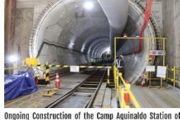
Ongoing Construction of the Camp Aguinaldo Station of the Metro Manila Subway Project (MMSPP) ©Sumitomo Mitsui Construction Co., Ltd.