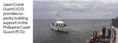
Japan Coast Guard (JCG) provides capacity building support to the Philippine Coast Guard (PCG)