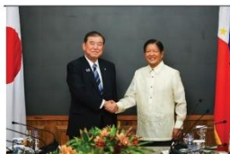
Japan-Philippines Summit Meeting: (L) Japanese Prime Minister ISHIBA Shigeru (R) Philippine President Ferdinand R. Marcos Jr.