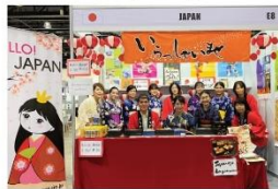
Embassy of Japan in the Philippines joins the 2024 International Bazaar at the World Trade Center in Pasay City