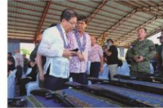
Ceremonial opening of the project, "Assistance for Security, Peace, Integration, and Recovery for Advancing Human Security in BARMM (ASPIRE)" in Kabuntalan, Maguindanao del Norte

terial Cut-off Treaty (FMCT) in September 2024, alongside the Philippines, exemplifies our collaborative approach. As fellow members of the Non-Proliferation and Disarmament Initiative, we are working together to enhance cooperation in nuclear disarmament and non-proliferation.