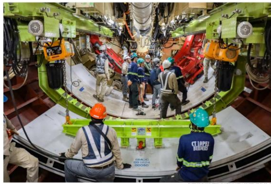
ONGOING Construction of the Camp Aguinaldo Station of the Metro Manila Subway Project (MNSP).