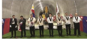
Successful connection of the north and south portals of one of the twin tunnels of the Davao City Bypass Construction Project