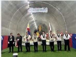
Successful completion of the earth-retention work of the Denza City Bypass Construction Project

Economic partnership is another important thread I would like to highlight. Japan has been consistently supporting sustainable development in the Philippines. The past year has seen a significant bolstering of our economic cooperation, with Japan contributing to priority infrastructure projects in the country. These include the Metro Manila Subway Project (MSP), the North-South Commuter Railway (NSCR), and the Denza City Bypass Construction Project—all funded by Japan's Official Development Assistance (ODA) through the Japan International Cooperation Agency (JICA). Apart from these projects, this year, we also celebrate the 50th anniversary of the Japan-Philippines Economic Cooperation Agreement (JPECA), which has been providing grassroots support for the development of various countries, including the Philippines.