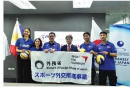
Turnover ceremony of volleyball supplies from the Japan Volleyball Association (JVA) to the Philippine National Volleyball Federation (PNVF)