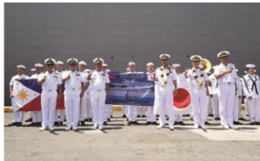
Japan Maritime Self-Defense Force (JMSDF) vessels JS ISE & JS SUZUNAMI conduct a port call at Pier 15, Port of Manila.