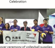
Turnover ceremony of volleyball supplies from the Japan Volleyball Association (JVA) to the Philippine National Volleyball Federation (PNVF)