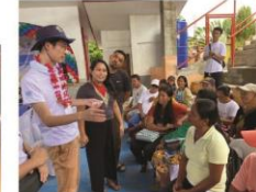
Restoring Livelihoods and Enhancing Resilience of Bohol Farmers and Fishermen Affected by Typhoon Odette