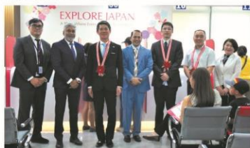
Opening of the Japan Visa Application Center in Parañaque City (JVAC)

Philippines, these significantly impact our economies. Following the relaxation of foreign ownership rules in retail, we've recently welcomed several prominent Japanese brands. Nitori opened its first store in 2024, shortly after I assumed my post last year. In addition, Mitsuokoshi BGC opened in mid-2023. These are landmarks in the growing Japanese retail presence in our market.