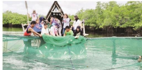
Restoring Livelihoods and Enhancing Resilience of Bohol Farmers and Fisherfolk Affected by Typhoon Odette