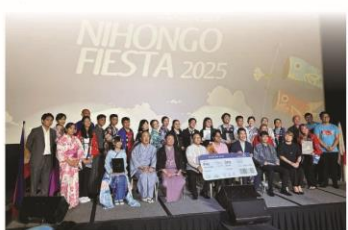
Nihongo Fiesta 2025 at the Red Carpet Cinema, Shangri-La Plaza, Mandaluyong City