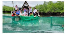
RESTORING Livelihoods and Enhancing Resilience of Bofed Farmers and Fishers Affected by Typhoon Odette.