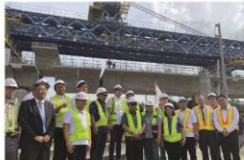
North-South Commuter Railway Project (Malolos-Tutuban) Viaduct Span Connection Ceremony