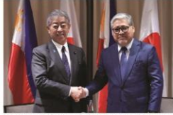
Foreign Minister Takeshi IWAYA and Secretary Enrique Manalo at the Japan-Philippines Foreign Ministers' Meeting