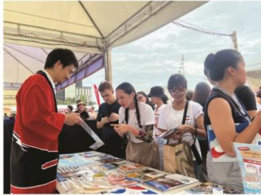
JNTO desk at Bon Odori Festival 2025 in Cebu