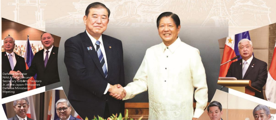
Defense Minister NAKATANI Gen and Secretary Gilberto Teodoro Jr. at the Japan-Philippines Defense Ministerial Meeting