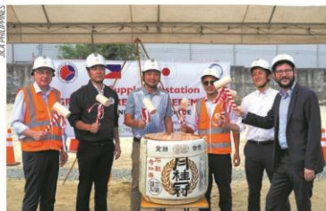
Officials from DoTr, JICA, EOJ, and project contractors celebrate the groundbreaking of the Bulk Supply Substation for the Subway Project.