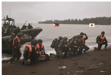
Japan Self-Defense Forces (JSDF) participate in BALIKATAN 40-2025 as observers