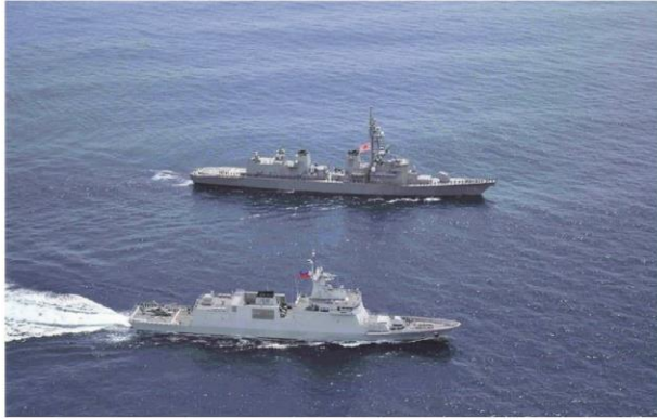
Japan Maritime Self-Defense Force (JMSDF) and the Philippine Navy (PN) conduct Bilateral Maritime Cooperative Activity (MCA) in the South China Sea