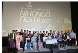
Nihongo Fiesta 2025 at the Red Carpet Cinema, Shangri-La Plaza, Mandaluyong City