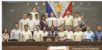
Senate Ratification of the Reciprocal Access Agreement (RAA)