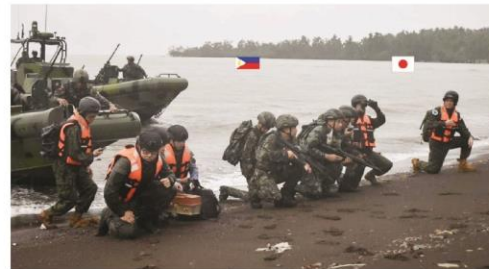
Japan Self-Defense Forces (JSDF) participate in BALIKATAN 40-2025 as observers

to strength, robust people-to-people and cultural ties continue to play a role in the foundational thread of our trust. In my various visits across the Philippines' vast regions, I've been truly overwhelmed by the local support for our bilateral partnership. It has been particularly heartwarming to witness our Filipino friends' deep interest in and shared love for Japanese culture, clearly demonstrated by the record-high of over 820,000 Filipino visitors to Japan last year. With the recent opening of the Japan Visa Application Center (JVAC), we are optimistic about sustaining this encouraging trend in the years ahead.