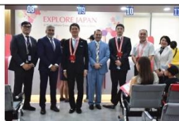
Opening of the Japan Visa Application Center in Paranaque City (JVAC)