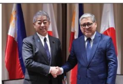
Foreign Minister Takeshi IWAYA and Secretary Enrique Manalo at the Japan-Philippines Foreign Ministers' Meeting