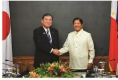
Japan-Philippines Summit Meeting: (L) Japanese Prime Minister ISHIBA Shigeru (R) Philippine President Ferdinand R. Marcos Jr.