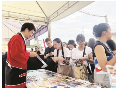
JNTO desk at Bon Odori Festival 2025 in Cebu