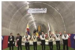
Ceremonial opening of the project, "Assistance for Security, Peace, Integration, and Recovery for Advancing Human Security in BARMM (ASPIRE)" in Kabuntalan, Maguindanao del Norte