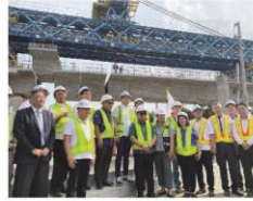
North-South Commuter Railway Project (Malolos-Tutuban) Viaduct Span Connection Ceremony