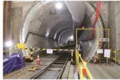
Completed expanded 22.46km Plaridel Bypass Road in the province of Bulacan