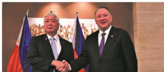
Defense Minister Nakatani Gen and Secretary Gilberto Teodoro, Jr. at the Japan-Philippines Defense Ministerial Meeting