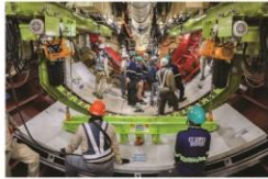
Ongoing Construction of the Camp Aguinaldo Station of the Metro Manila Subway Project (MMSP)