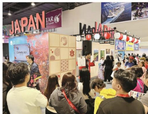
Japan pavilion at Travel Madness Expo 2025 | ©JNTO Philippines