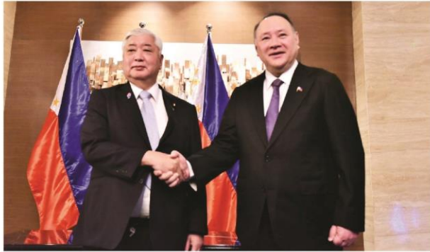
Defense Minister NAKATANI Gen and Secretary Gilberto Teodoro Jr. at the Japan-Philippines Defense Ministerial Meeting