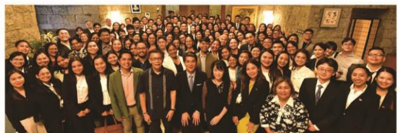
Japan Exchange Teaching (JET) Programme Fellowship Reception at the Ambassador's Residence