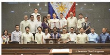
Senate Ratification of the Reciprocal Access Agreement (RAA)