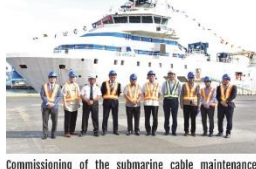
Commissioning of the submarine cable maintenance vessel, the VEGA II