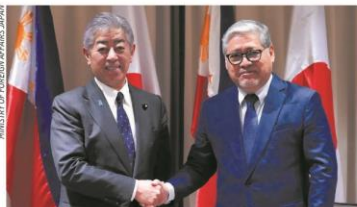
Foreign Minister Takeshi Iwata and Secretary Enrique Manalo at the Japan-Philippines Foreign Ministers' Meeting

The strong economic ties between Japan and the Philippines are the cornerstone of our friendship. Japan remains as one of the top investors in the Philippines, especially in Philippine Economic Zone Authority (PEZA) locations. With cumulative investments exceeding P550 billion and direct employment of over 300,000