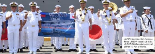
JAPAN Maritime Self-Defense Force (JMSDF) vessels JS SE & JS SUZUNAMI conduct a port call at Port 15, Port of Manila.