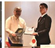
Signing and Exchange of Notes for the 2nd Official Security Assistance (OSA) Project