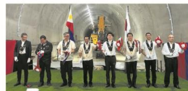
Successful connection of the north and south portals of one of the twin tunnels of the Davao City Bypass Construction Project