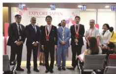
Opening of the Japan Visa Application Center in Paranaque City (JVAC)

Economic partnership is another important thread I would like to highlight. Japan has been consistently supporting sustainable development in the Philippines. The past year has seen a significant bolstering of our economic cooperation, with Japan contributing to quality infrastructure projects in the country. These include the Metro Manila Subway Project (MMS), the North-South Commuter Railway (NSCR), and the Davao City Bypass Construction Project — all funded by Japan's Official Development Assistance (ODA) through the Japan International Cooperation Agency (JICA). Apart from these