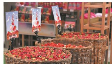
Japanese strawberries make inroads to Mitsukoshi Mall following successful talks between the Ministry of Agriculture, Forestry and Fisheries of Japan (MAFF) and Philippine authorities.