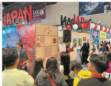
Japan pavilion at Travel Madness Expo 2025