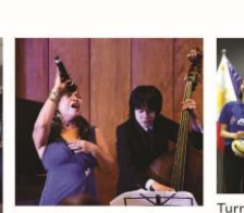
Special Japan Cultural Night: Jazz Concert at the Ambassador's Residence