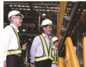
Inspection of the newly inaugurated LRT Line 1 Cavite Extension Phase 1