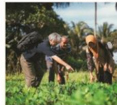
JICA expert with agricultural worker and farmer beneficiary from BARM